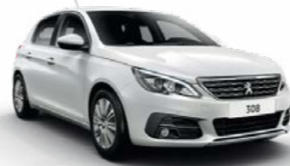
Pearl White** (Pearlescent)