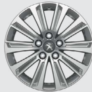
16" ZYRCON alloy wheels

Designed to complement the sharp exterior design, the new PEUGEOT 308 comes with the 16" ZYRCON alloy wheel.