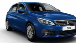
Magnetic Blue** (Metallic)