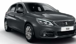
Nimbus Grey** (Metallic)