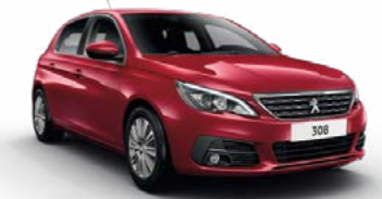
Ultimate Red** (Special)