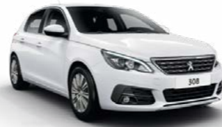
Bianca White (Solid)*