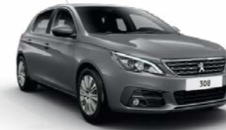
Cumulus Grey** (Metallic)