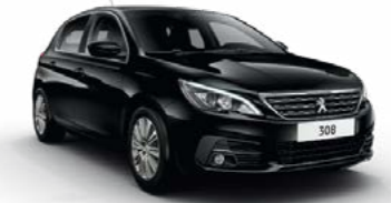
Nera Black** (Metallic)