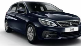
Twilight Blue** (Metallic)