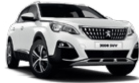
Bianca White (Matt)