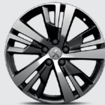
18" 'DETROIT' Two-tone diamond-cut alloy wheels