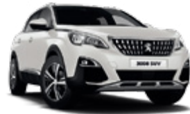
Pearl White (Pearlescent)