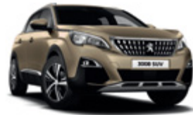
Pyrite Beige (Metallic)

Choose the colour that matches your character from the fourteen in our colour range.