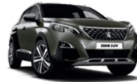
Amazonite Grey/Nera Black (CF Metallic)