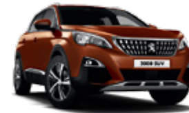
Sunset Copper (Metallic)