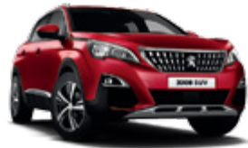
Ultimate Red (Special Metallic)