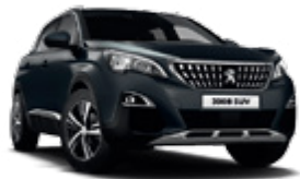
Hurricane Grey (Matt)