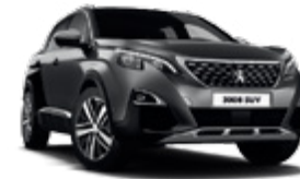
Nimbus Grey/Nera Black (CF Metallic)