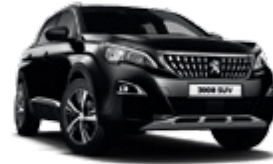
Perla Nera (Metallic)