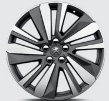
19" 'WASHINGTON' Two-tone diamond-cut alloy wheels