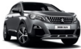
Artense Grey (Metallic)