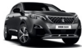
Platinum Grey (Metallic)