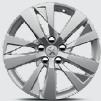
17" 'CHICAGO' alloy

Designed to complement the sharp exterior design, the new PEUGEOT 3008 SUV is available with a choice of alloy wheels in either painted or two-tone diamond-cut finishes.