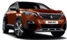
Sunset Copper/Nera Black (CF Metallic)

CF - Coupe Franche dual-colour paint design