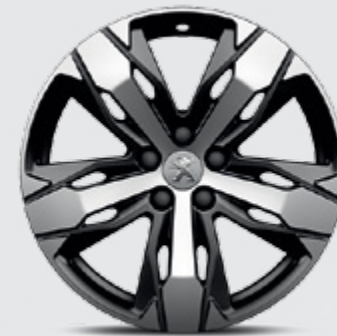
18" 'LOS ANGELES' Two-tone diamond-cut alloy wheels (linked to Advanced Grip Control®)