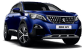
Magnetic Blue (Metallic)