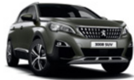
Smart Grey (Metallic)